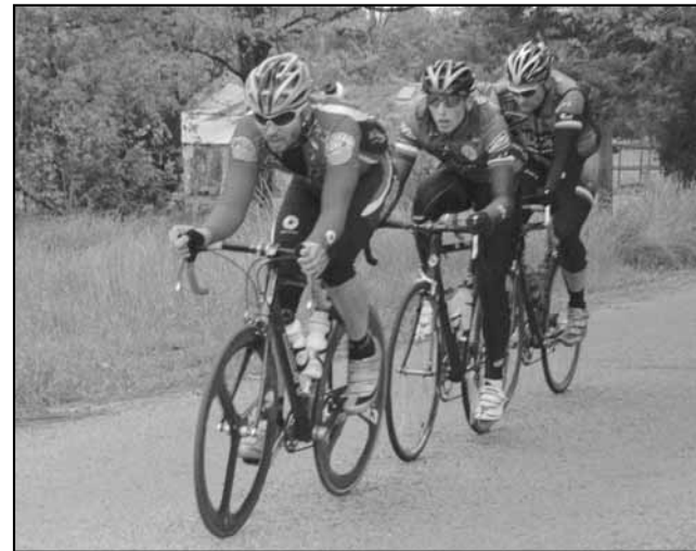
Bikers conserve energy by drafting off each other during the race as they travel the county roads.